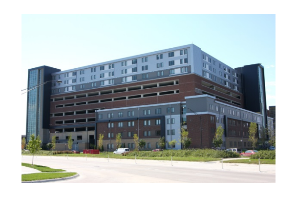
Winning Project ... The 50/50 Mixed Use Facility by Hausmann Construction