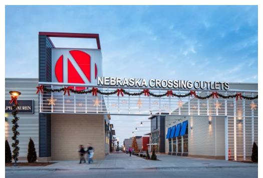
Honorable Mention... Nebraska Crossing Outlet Redevelopment by Kiewit Building Group